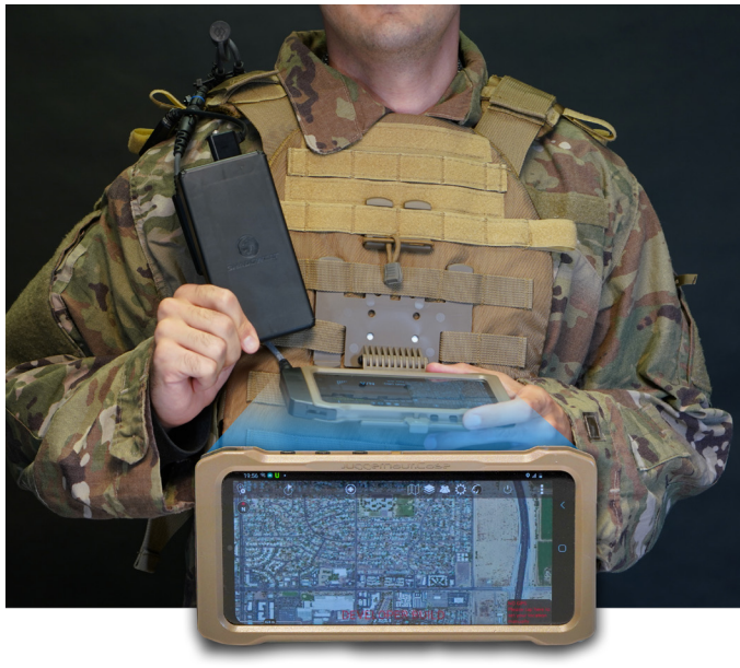
ATAK with PLI