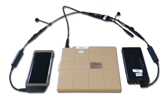
End User Device + ATAK Nett Warrior